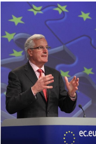
Commissioner M. Barnier in charge of Internal Market and Services

EASPD and its Policy Impact Group will assess the directive in detail and it will contribute actively to the debate.